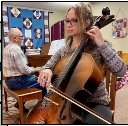
Special Music during Worship