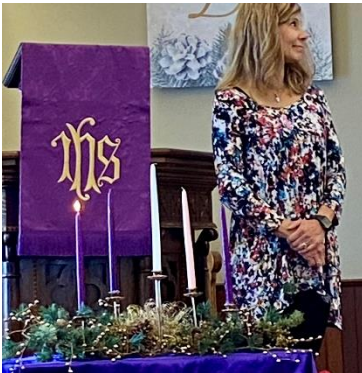
Advent Candle Lighting